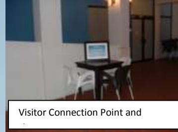
Visitor Connection Point and