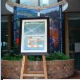
Welcome and Map signage