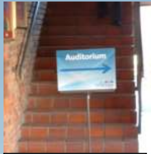
Auditorium signage outside staffroom